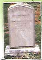
45 First Burial