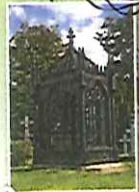
1 James Monroe